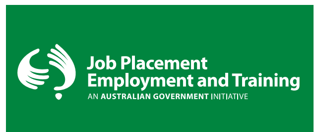
White – Reversed out of PMS 356 Green