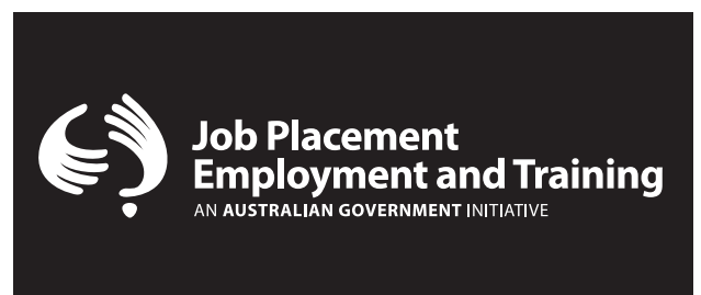
White – Reversed out of Black