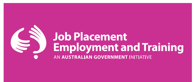
White – Reversed out of PMS 240 Magenta

To ensure that the logo retains its prominence and integrity, there should be an 'exclusion zone' around the logo on all sides. This space (X) is determined by measuring the space between the right hand side of the thumb print under the hands and the left hand edge of the text. At the minimum logo size, this space measures 7mm.